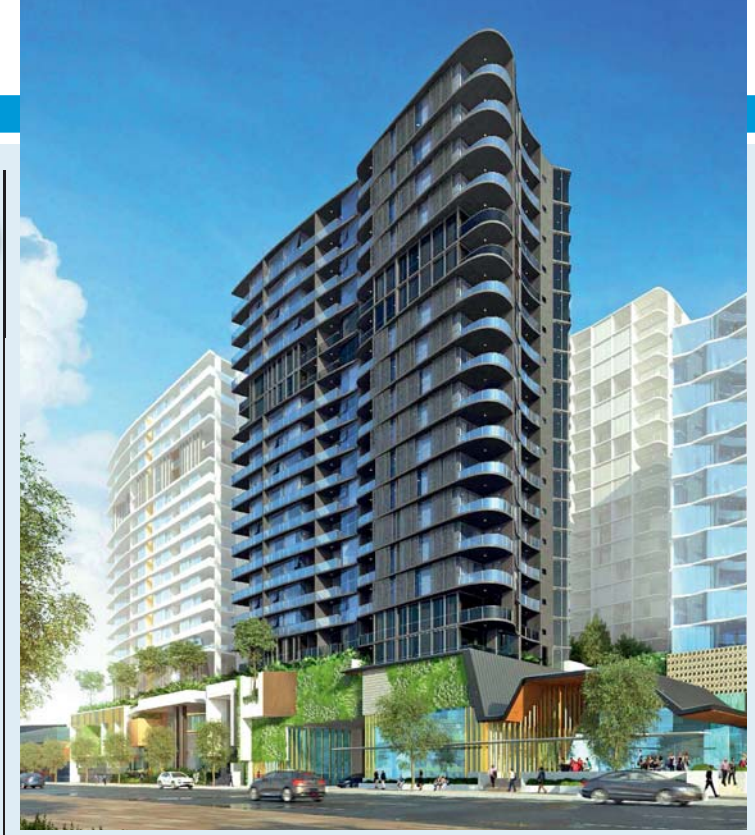
The 20-level residential tower Capri – Newstead Central stage four.

Stage two of the Icon project in Hobart's CBD involves the redevelopment of the now closed Murray Street Myer into premium retail outlets and extensions to the new Myer.