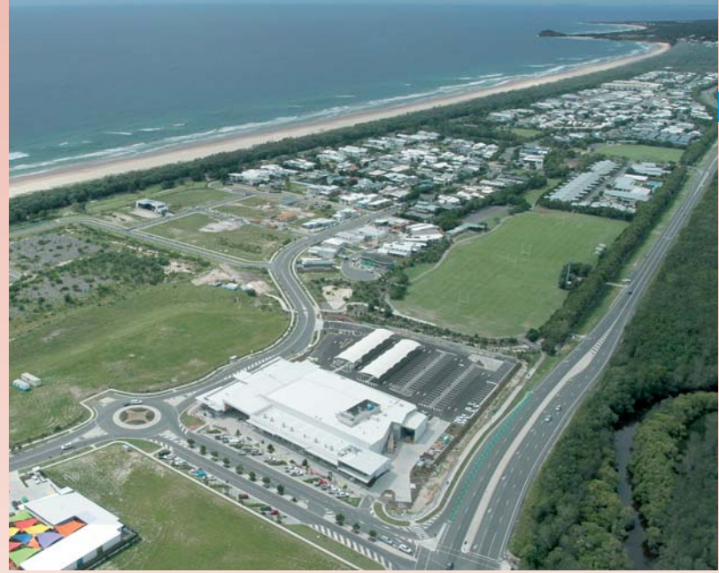
Casuarina Village Shopping Centre opened in February – four weeks ahead of schedule.