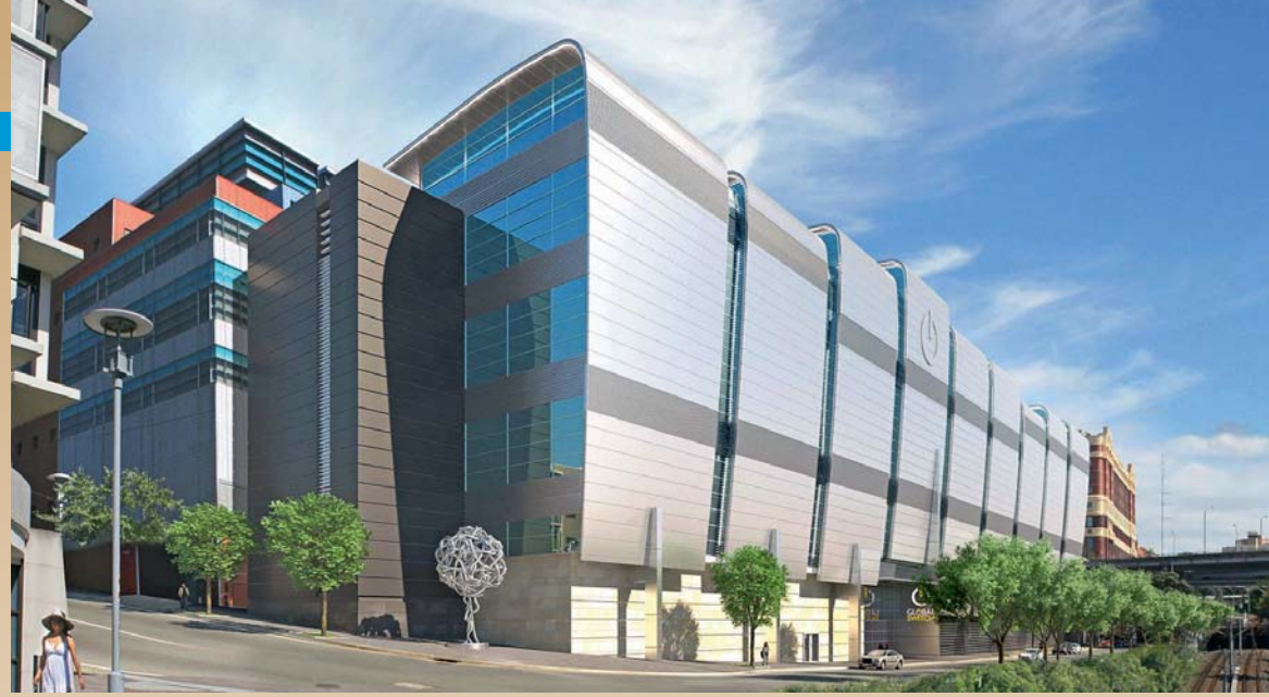
Global Switch's expanded Sydney East Data Centre has been designed to meet its customers' requirements for the next 20 years.

On completion, the three combined stages, totalling 31,000 square metres, will act as a standalone facility with Hutchies having